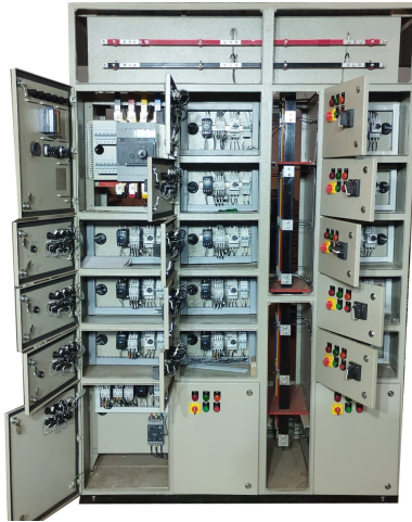
Furnace Control Panel