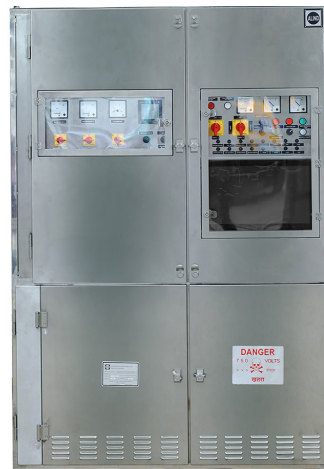
Furnace Control Panel