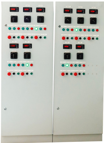
Relay Control Panel