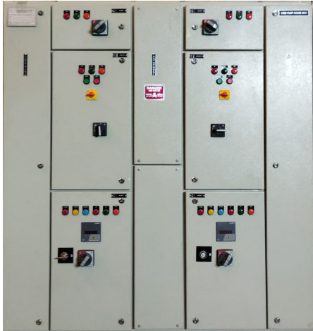
Pump House Control Panel

Stesalit Systems is engaged in manufacturing and supplying of a wide range of Electrical and Instrument Control Panels, which is widely used across different industries for a variety of applications